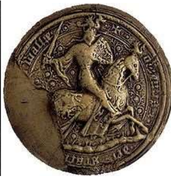
11 his seal