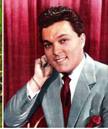
3 1950's singer