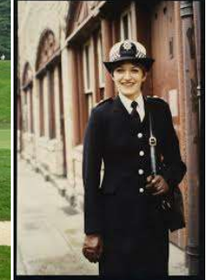
11 tv series