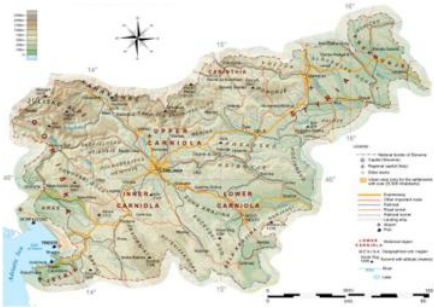
4 A country