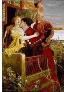
5&6 2 famous characters