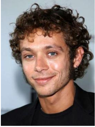
1 Bike rider -doctor