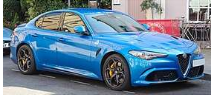
7 Car manufacturer