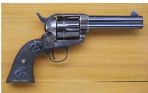
15 type of gun