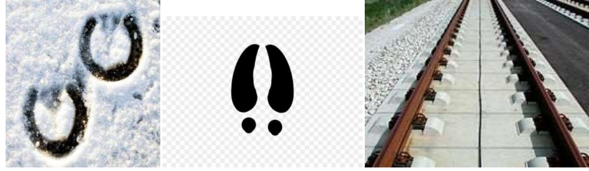
6 7 8