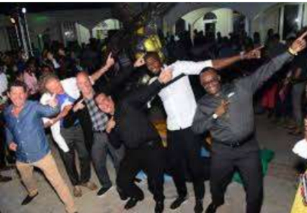
15 whose track