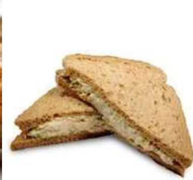
19 (4 words)