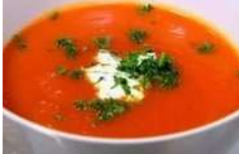
14 specific (2 words)