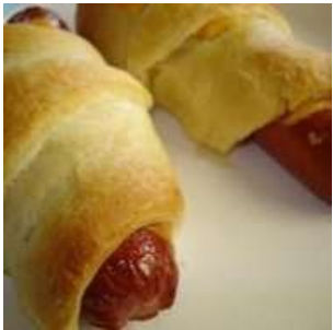
13 (3 words)