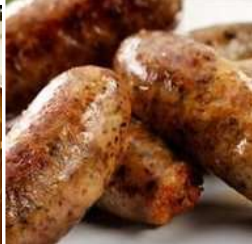
18 specific(2 words)