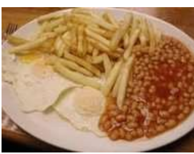
10 (4 words)