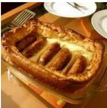
17 (4 words)