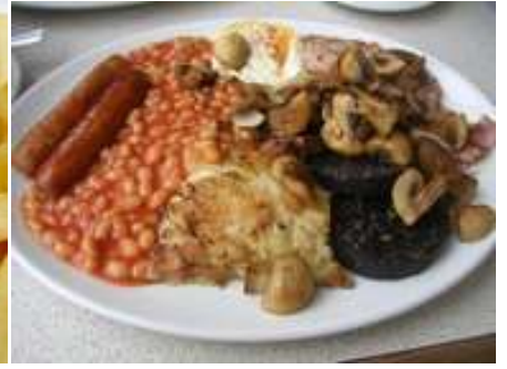
4 whole (2 words)