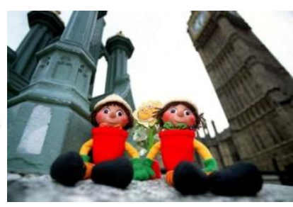
4 name all three