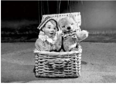
1 name both